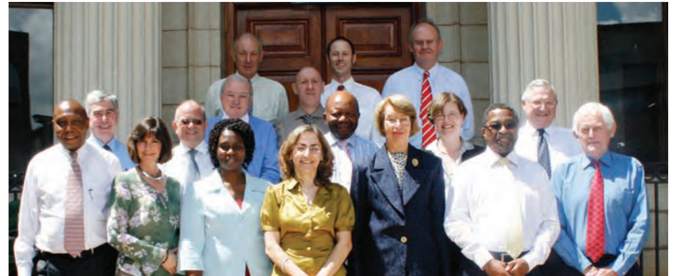
SAIIA National Council