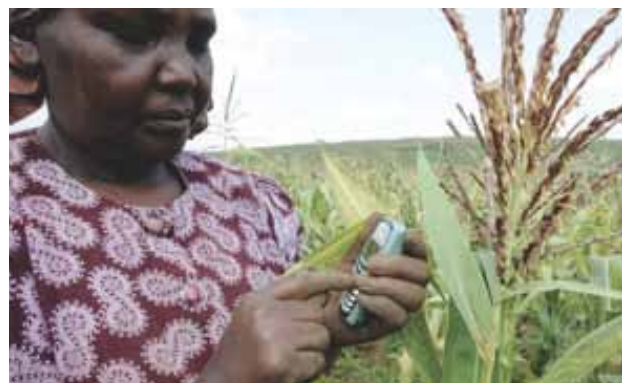
Figure 2: Cellphone technology assists African farmers