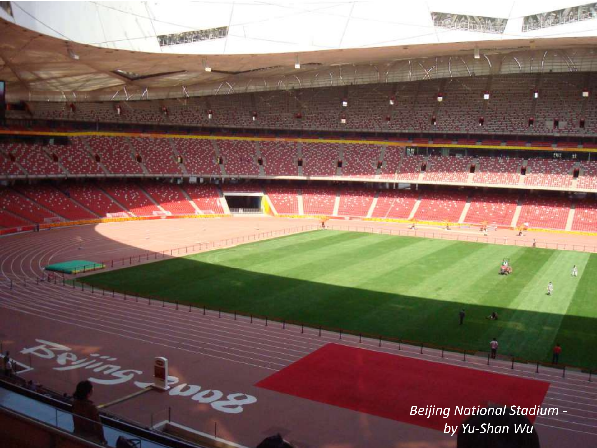
Beijing National Stadium - by Yu-Shan Wu