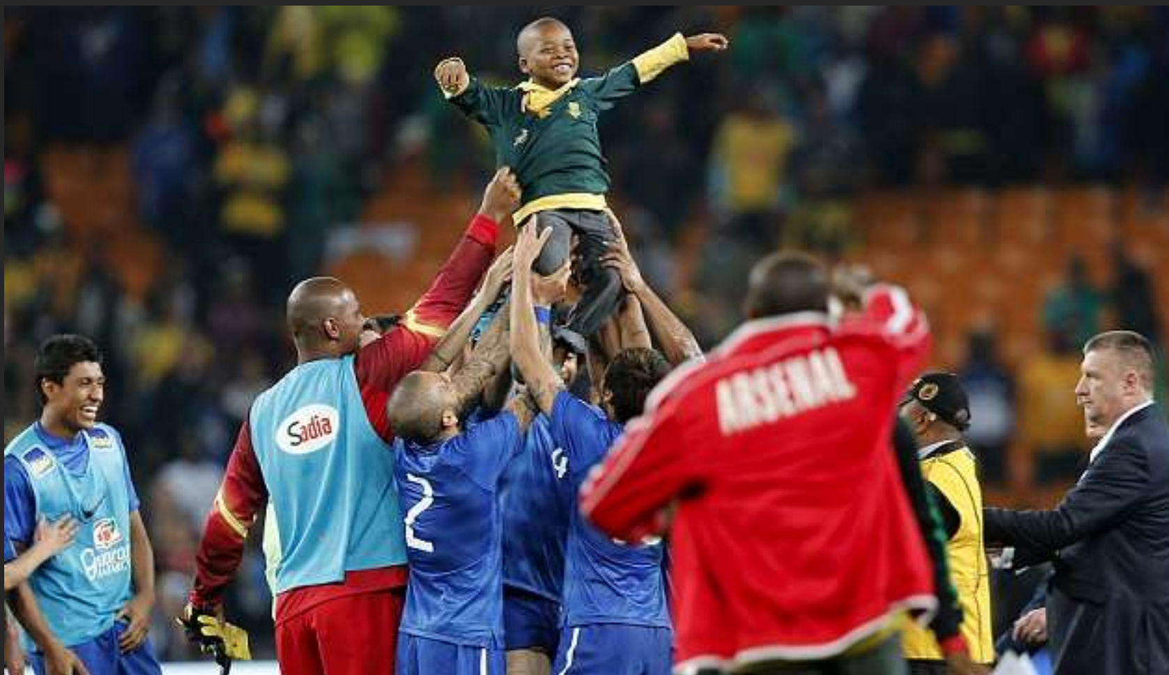
Brazil vs. South Africa, Johannesburg, 5 March 2014.