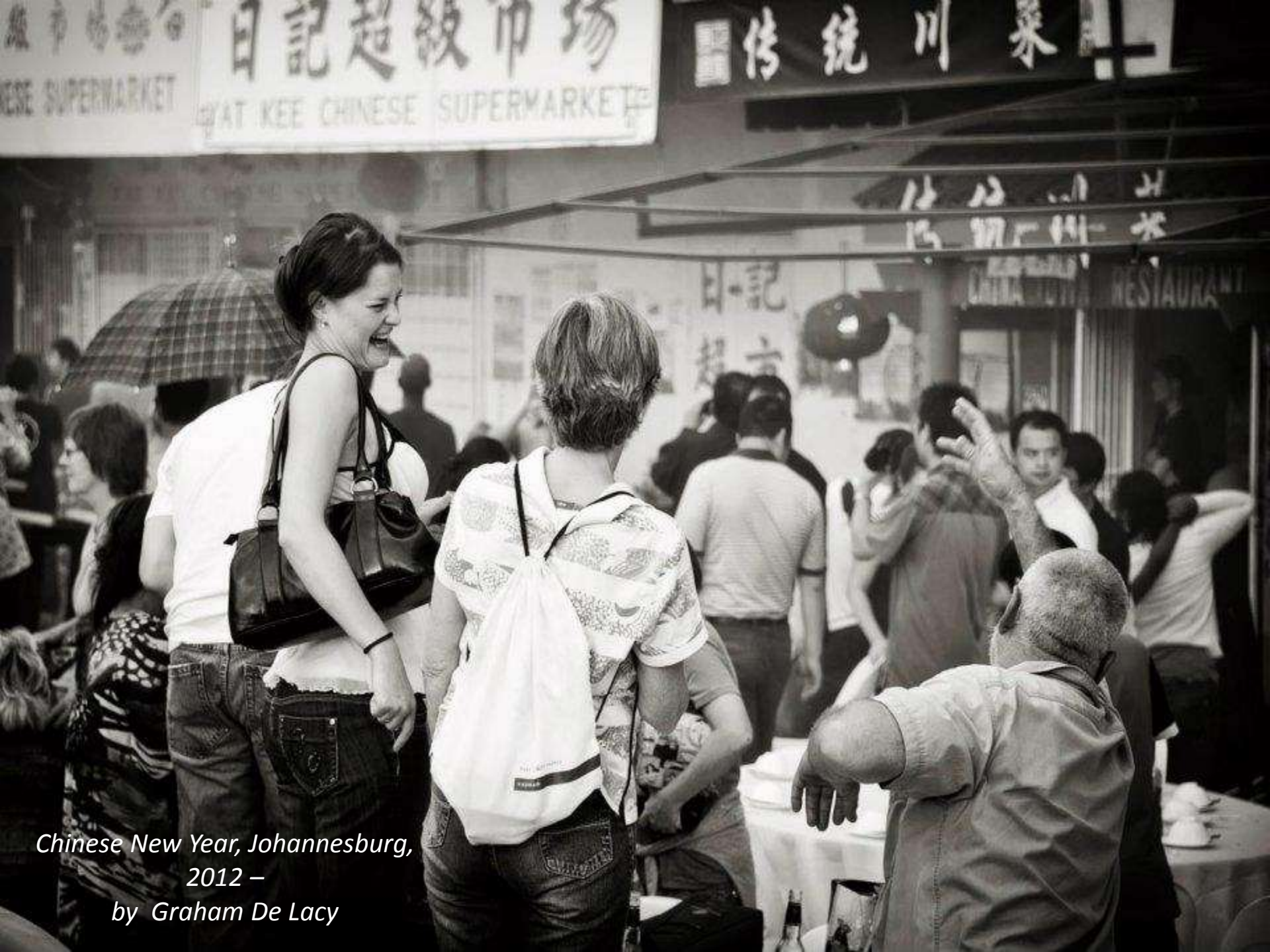
Chinese New Year, Johannesburg, 2012