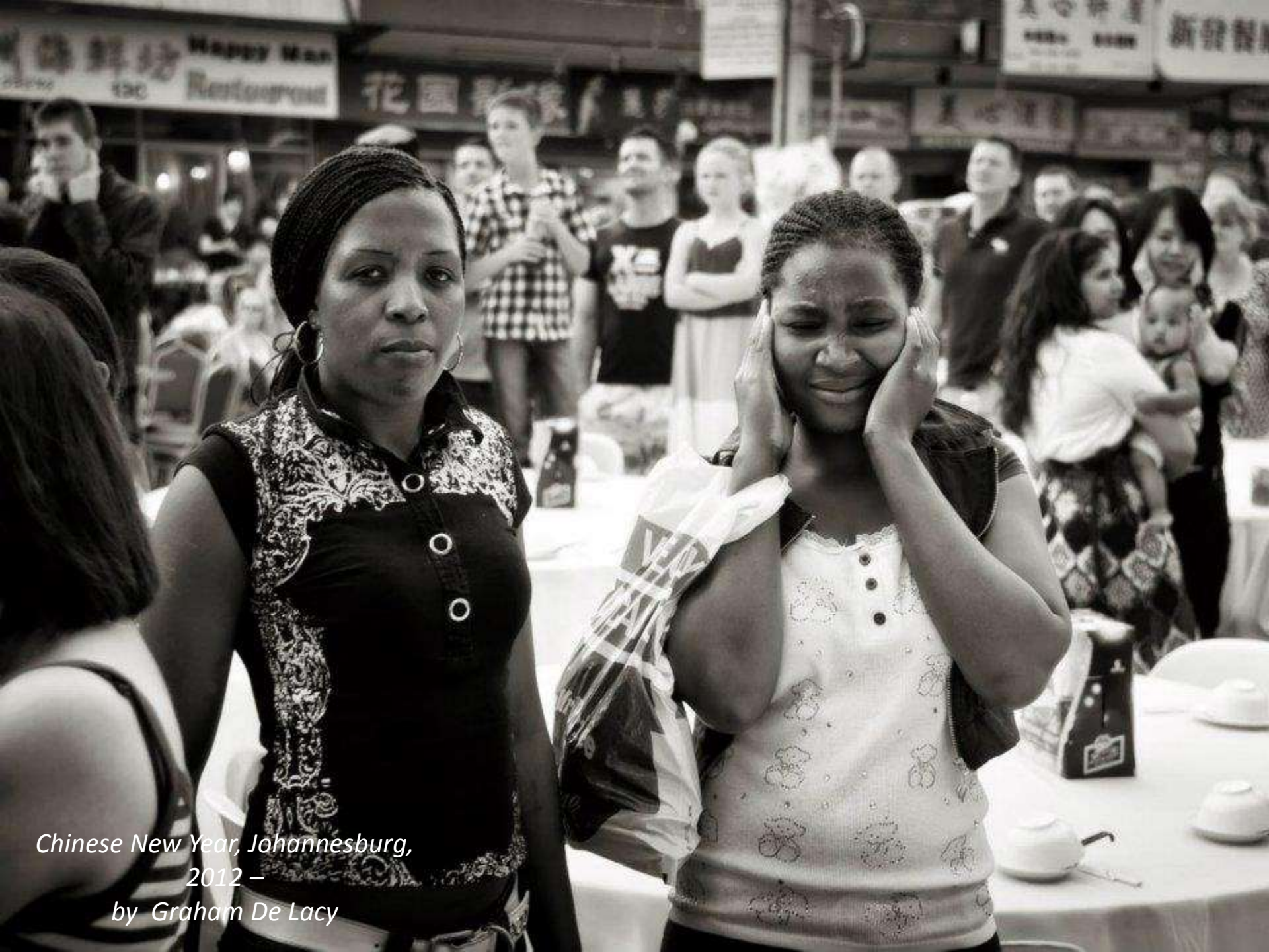
Chinese New Year, Johannesburg, 2012