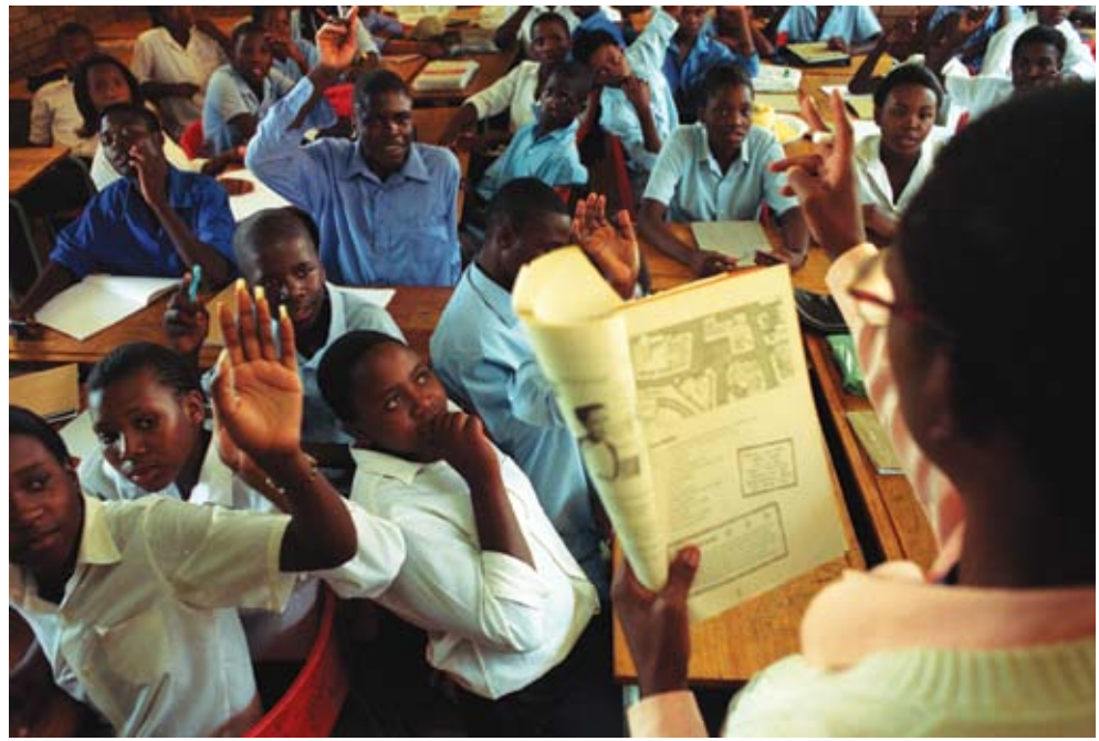
Learners try to concentrate on what the teacher is saying in an overcrowded classroom in a secondary school in Naboomspruit, South Africa

subject areas. Comparative research elsewhere has identified the nature and perception of the teaching profession as a challenge in itself. Among other factors, poor pay, indifferent management, declining social regard for the profession and an inhospitable policy environment (difficult or changing policy demands) severely undermine the motivation of teachers, and as a result the education they deliver to their charges.<sup>25</sup>