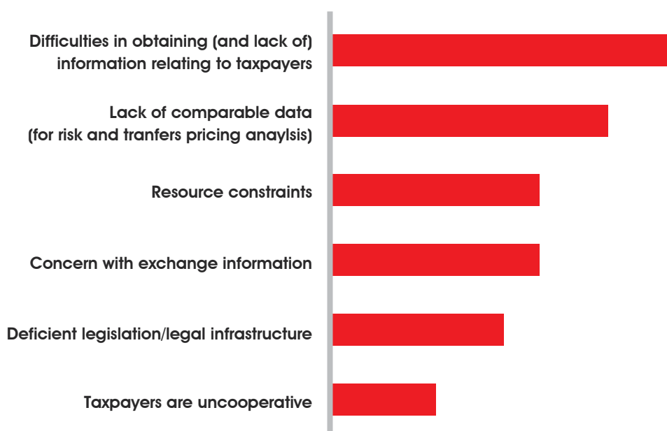
FIGURE 2 OBSTACLES TO DETERMINING WHETHER THE APPROPRIATE PROFITS HAVE BEEN REPORTED