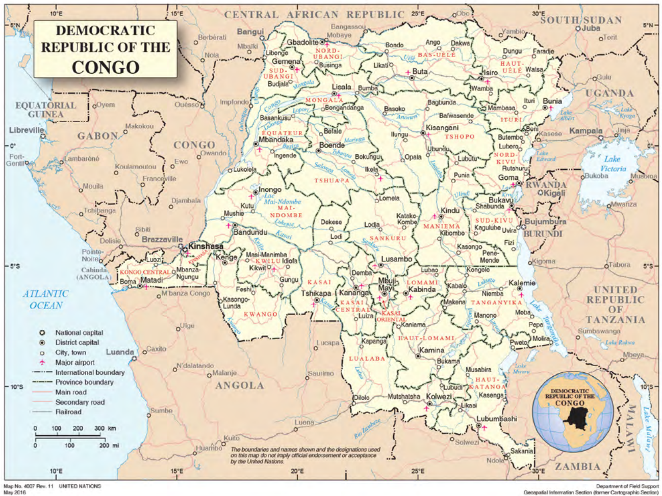
FIGURE 1 MAP OF THE DRC