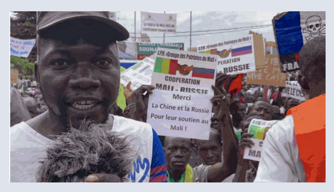
Figure 2 A supporter of the August 2020 coup d'état in Mali holds up a sign that reads 'Thank you Russia and China for support in Mali'