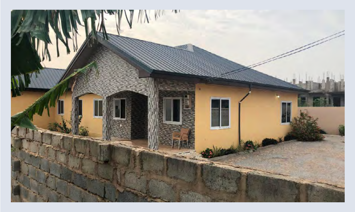
Figure 4 The compound rented by EBLA in Accra, Ghana