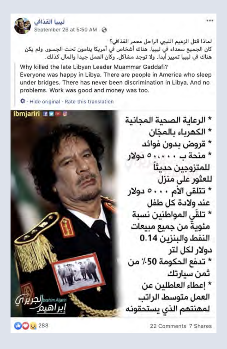
Figure 3 A post from the 'Libya Gaddafi' Facebook page