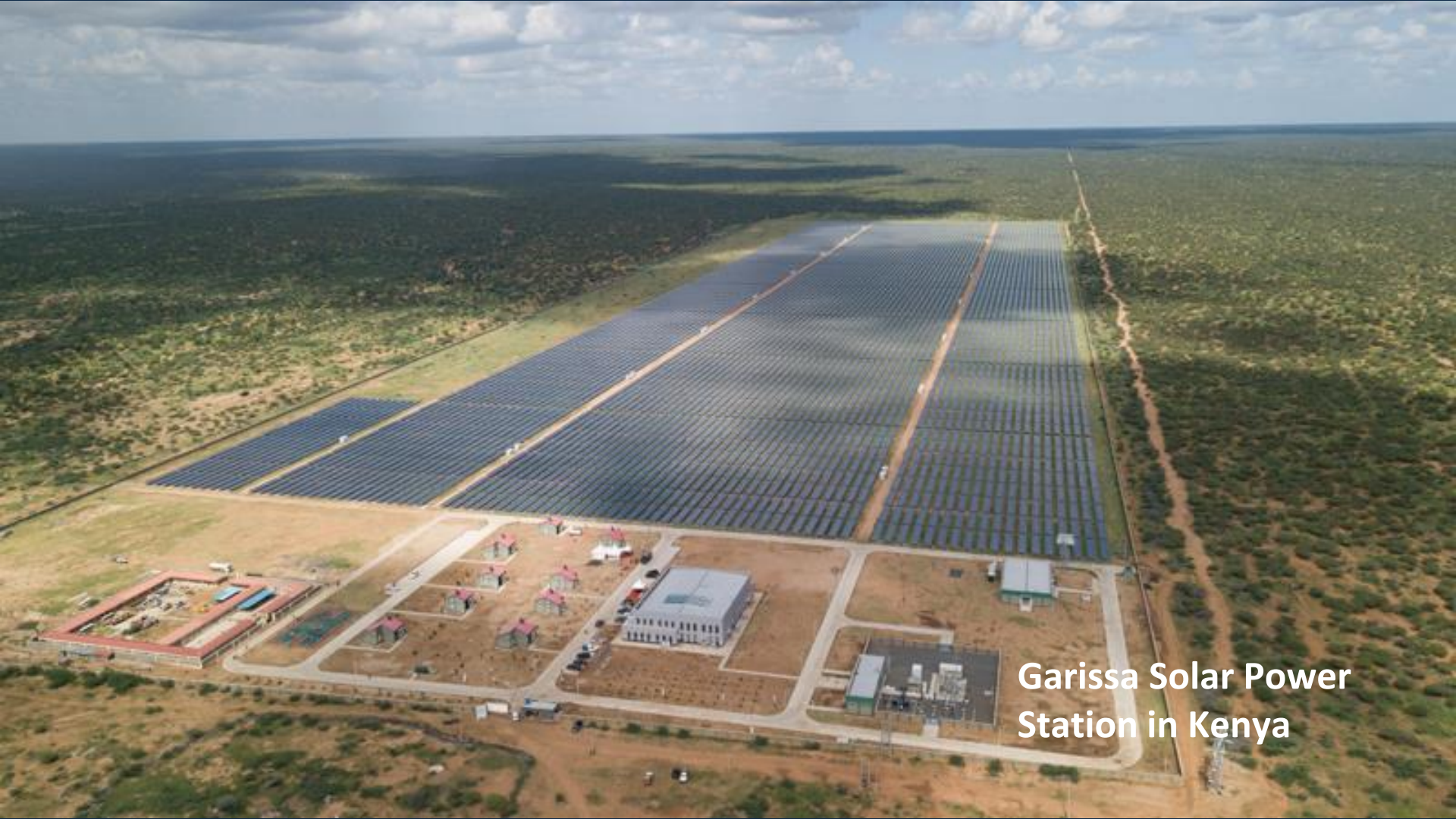
Garissa Solar Power Station in Kenya